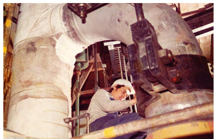
Nuclear pieces produced in the seventies